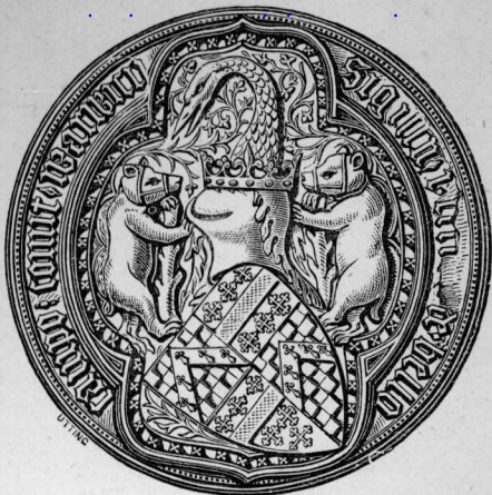
Seal of Sir RICHARD DE BEAUCHAMP, K.G., Fifth Earl of WARWICK : died A.D. 1439. (No. 448.—See pages 215, 321.)