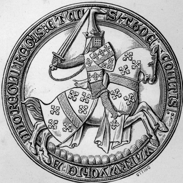
Seal of Sir THOMAS DE BEAUCHAMP, K.G., Third Earl of WARWICK : died A.D. 1369. Date of the Seal, 1344. No. 446 — See No. 447, page 322 ; also see page 321.)