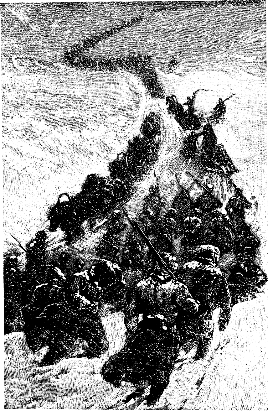
A MARCHING PARTY OF EXILES PASSING A TRAIN OF FREIGHT-SLEDGES.