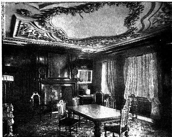
Valentine & Sons, Ltd.,]