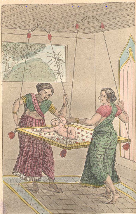
A Hindoo Cradle .