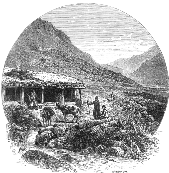
HOUSE AT BEZINGI.

WITH ILLUSTRATIONS ENGRAVED BY ED. WHYMPER, FROM PHOTOGRAPHS TAKEN DURING THE JOURNEY BY H. WALKER AND A MAP OF THE COUNTRY TRAVERSED.