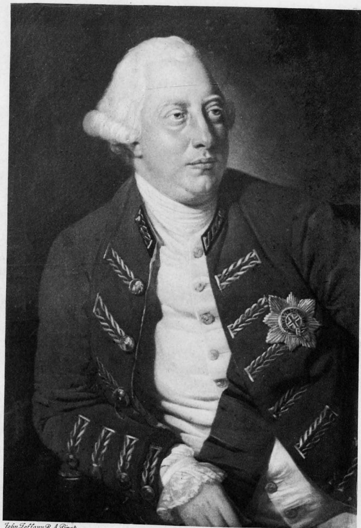
John Zoffany R.A. Pinxt.