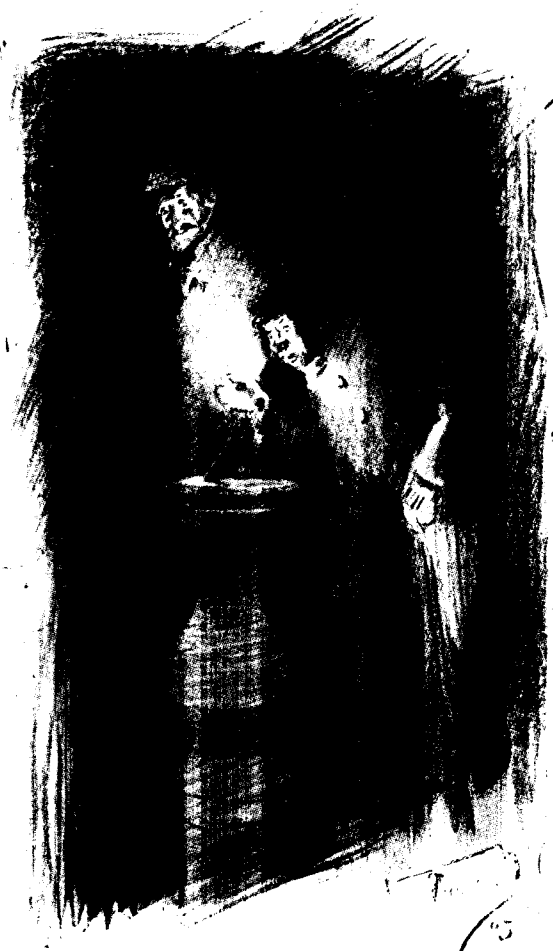
BROWN'S COUNTRY HOUSE.— Brown (who takes a friend home to see his new purchase, and strikes a light to show it). "Confound it, the beastly thing's stopped!"