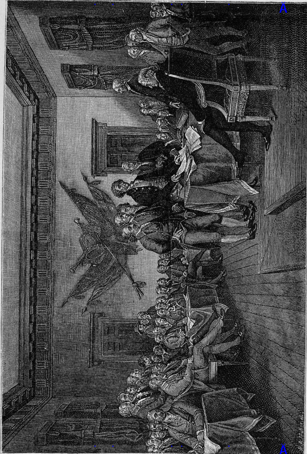
SIGNING THE DECLARATION OF INDEPENDENCE.