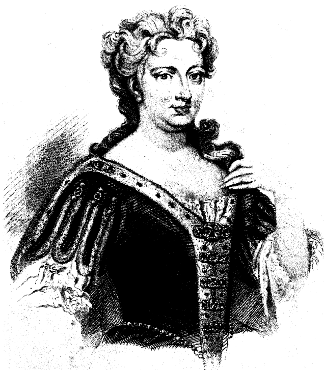
Caroline. Consort of George II.