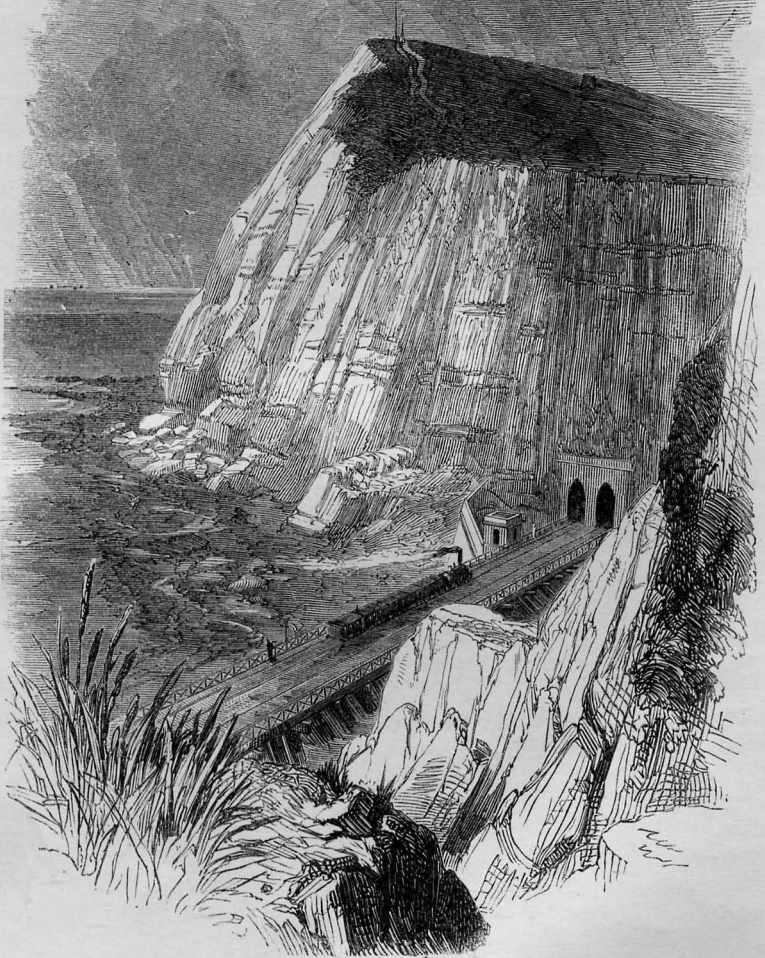
SHAKESPEARE'S CLIFF—SOUTH-EASTERN RAILWAY.