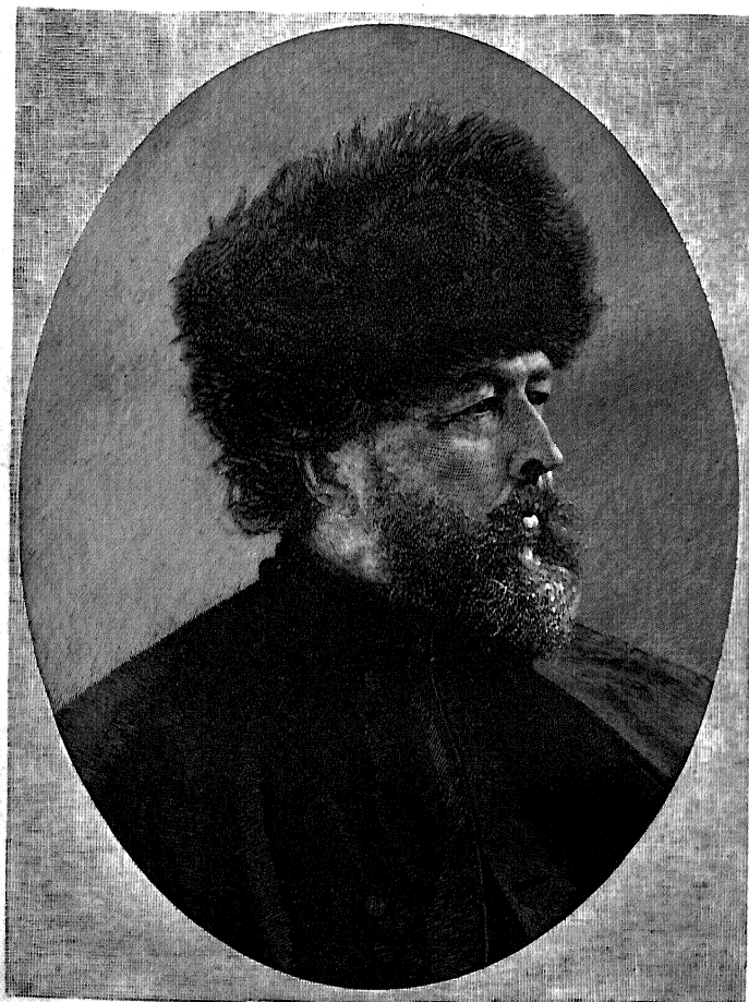
From a photograph by Sarony, taken in 1862.