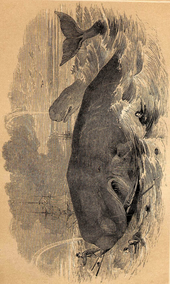
A HEAVY SEA THREW BOATS AND MEN INTO THE WHALE'S MOUTH.