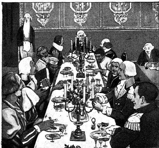
“THE BRILLIANT COMPANY WAS ARRANGED ABOUT THE BOARD”