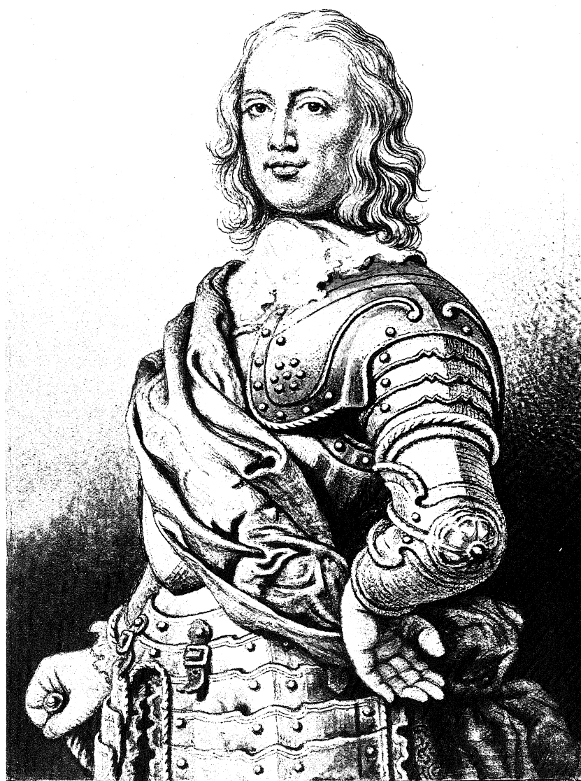
SIR WILLIAM LOCKHART.