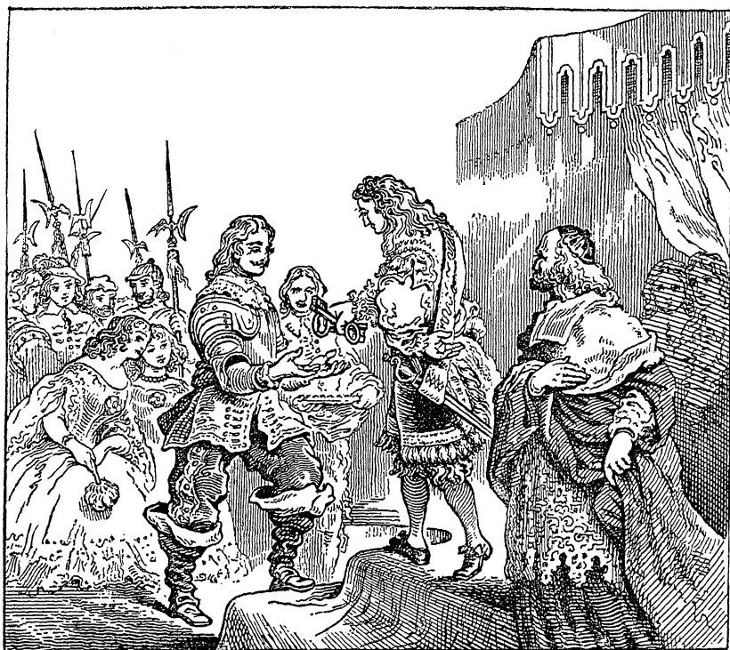
LOUIS XIV placing the keys of DUNKIRK in the hands of Sir W m · LOCKHART.