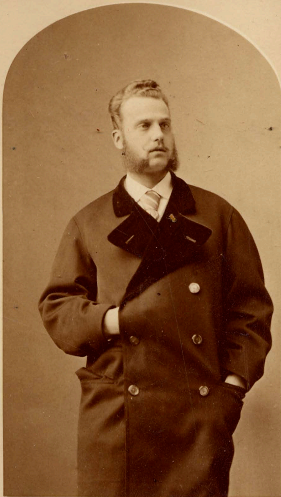
THE GRAND DUKE ALEXIS