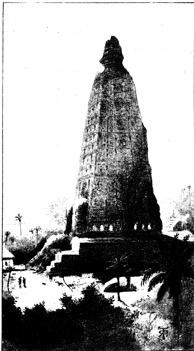
BUDDHA-GAYA, A.D. 1870.