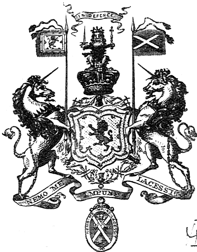
ROYAL ARMS OF SCOTLAND