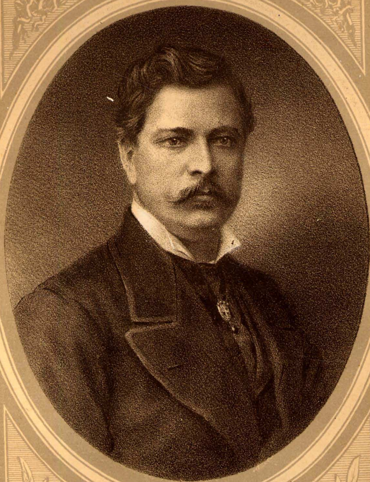
H. M. STANLEY,

from a Photograph by Mauli & Co. Taken 1 week before his departure from England, 1874. A