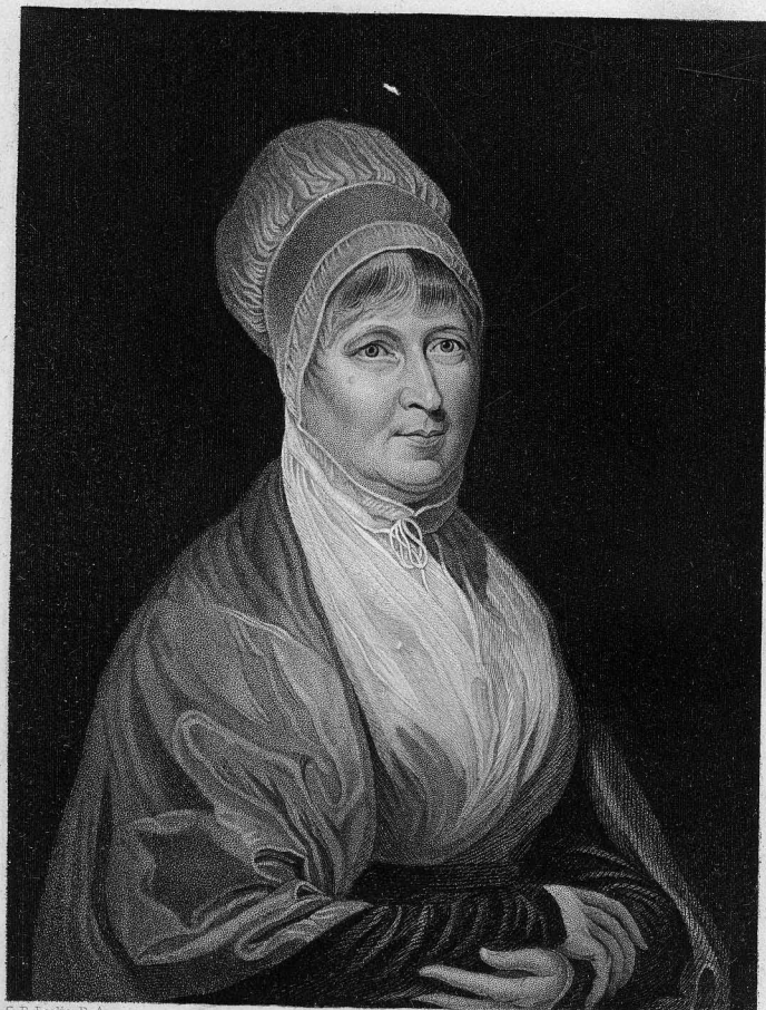
C.R. Leslie R.A.