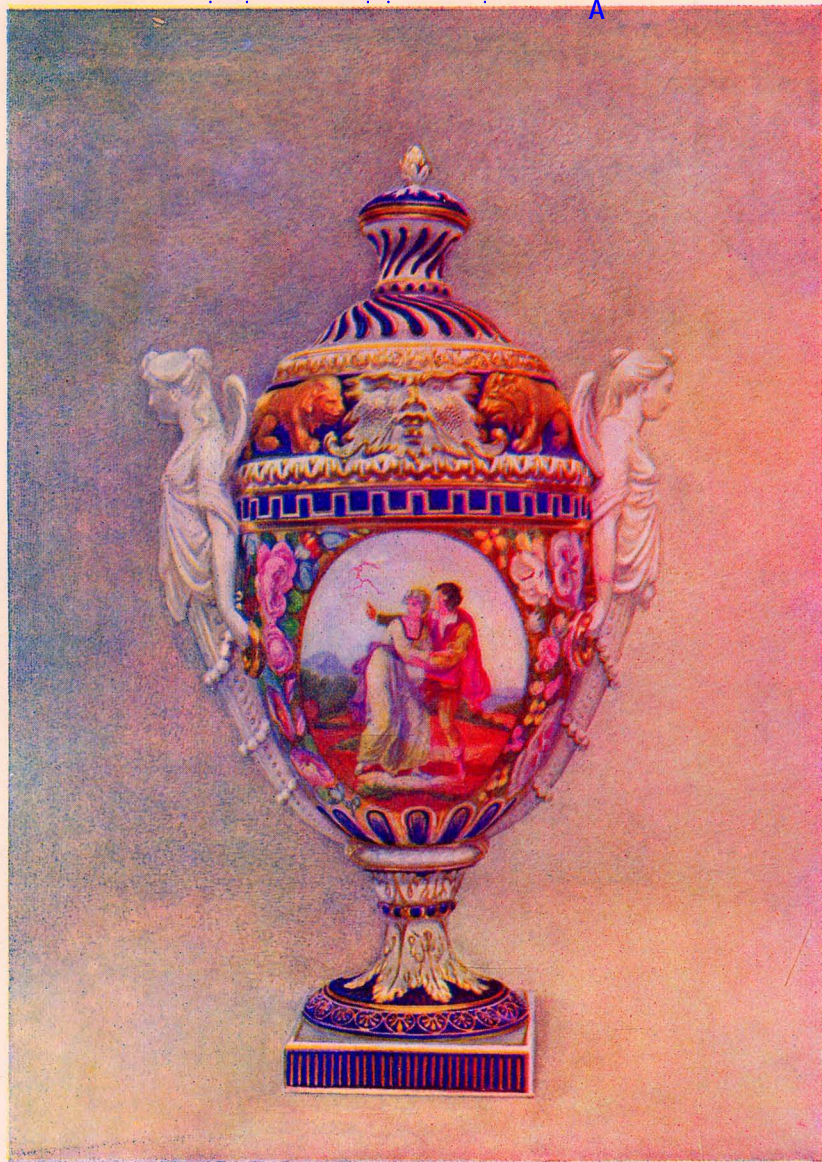
CHELSEA-DERBY PORCELAIN VASE, WITH Biscuit HANDLES