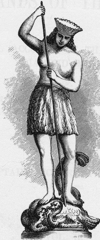
Brazil is usually represented by a Tupy Woman.