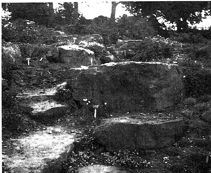
VIEW IN A ROCK GARDEN MADE BY R. W. & CO.

A Special Feature of our Business is the design, construction, and planting of