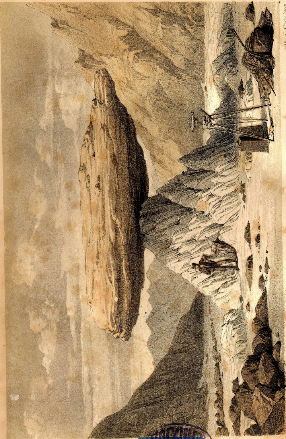
GLACIER TABLE, ON THE MER DE GLACE.