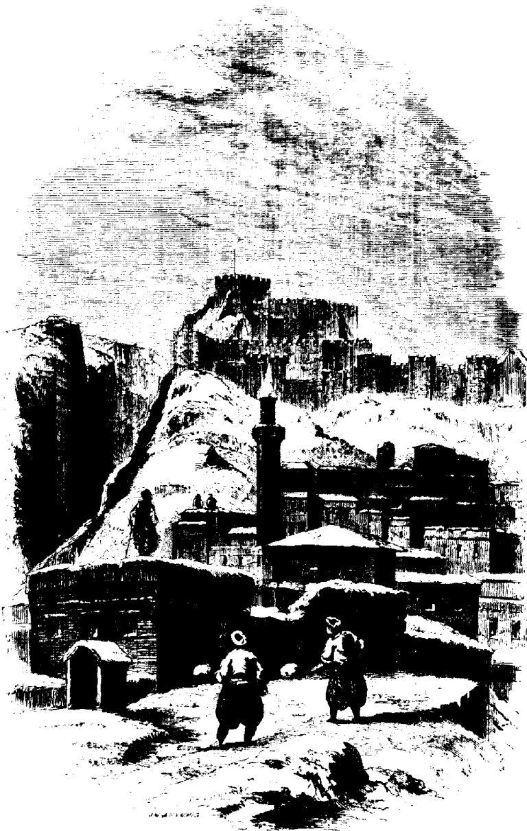
THE OLD CASTLE OF KARS. From a sketch by Major Leedale.