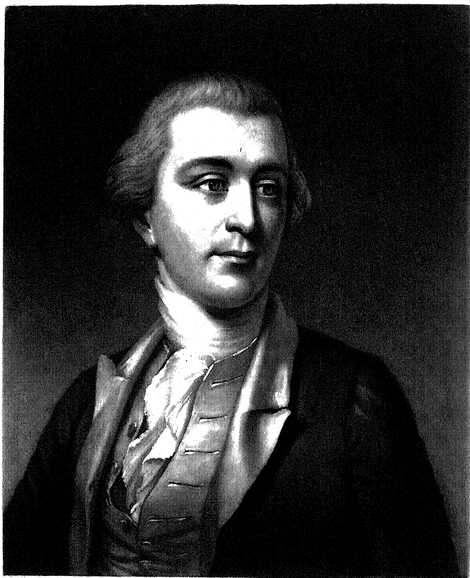
Painted by C. M. Peale.