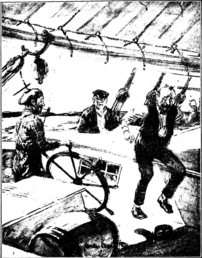
"Captain Scraggs threw his brown derby on the deck and leaped upon it"