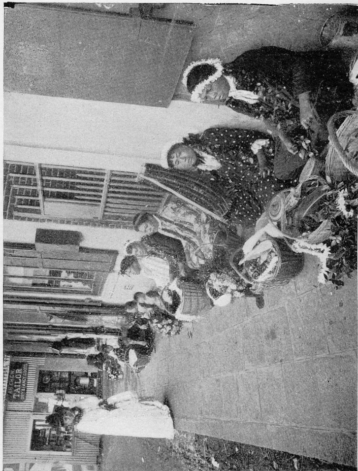
NATIVE WOMEN SELLING LEIS.