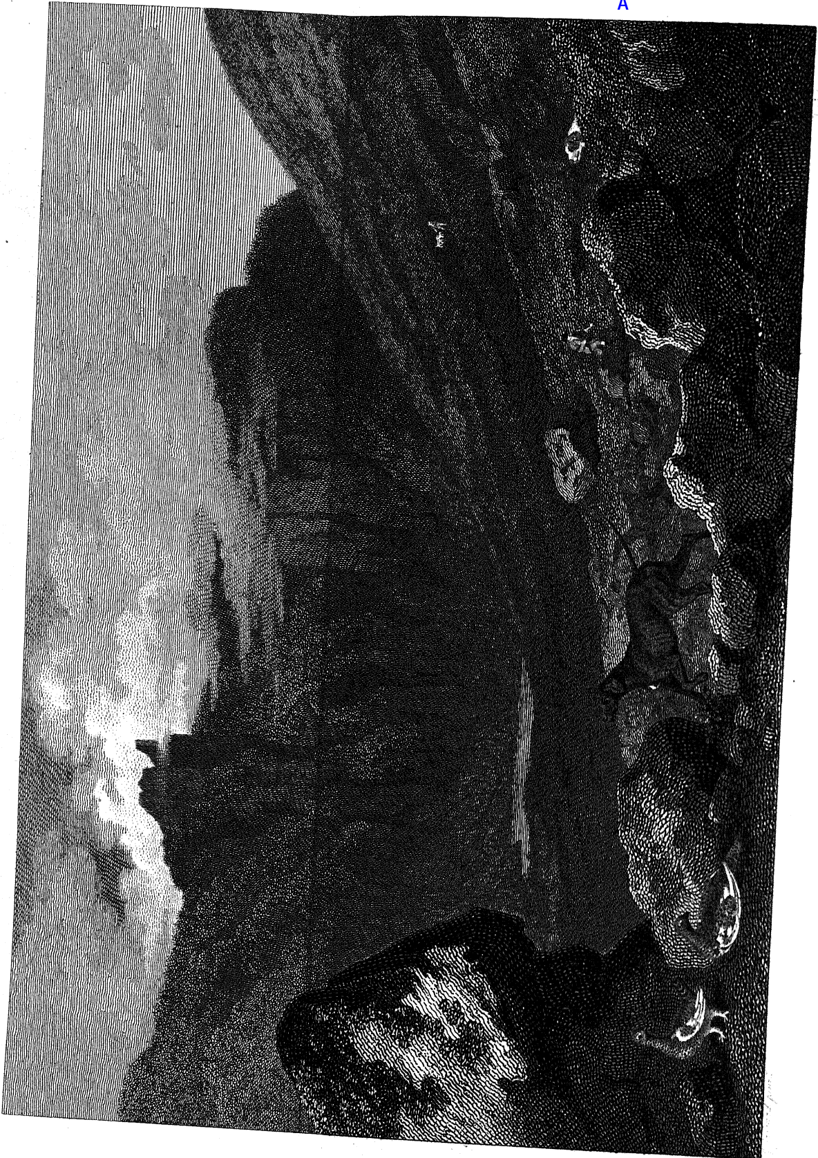
SCENERY IN THE HIGHLANDS OF SCOTLAND.