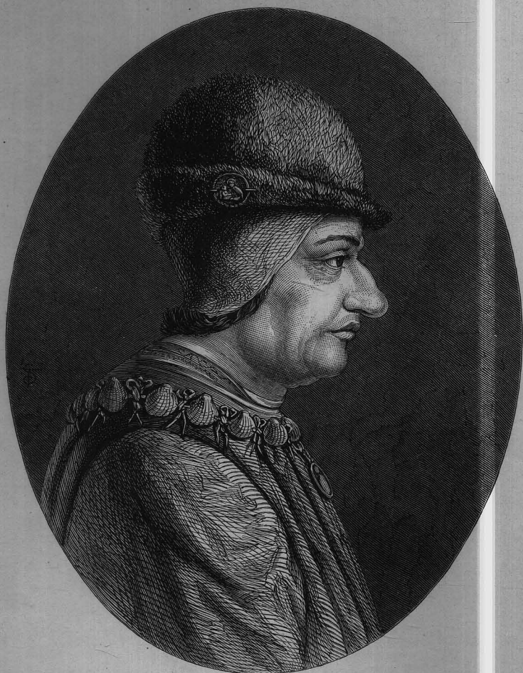
LOUIS THE ELEVENTH.

From a Painting formerly at Fontainebleau