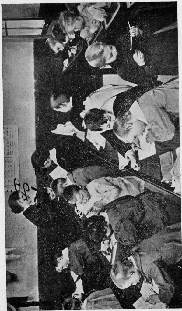
FRENCH SCHOOL-CHILDREN AT WORK.