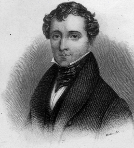
G. P. R. JAMES.