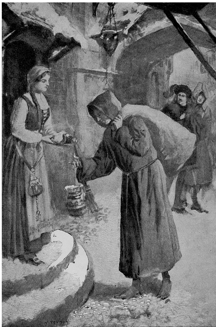
Luther begging in the streets of Erfurt.