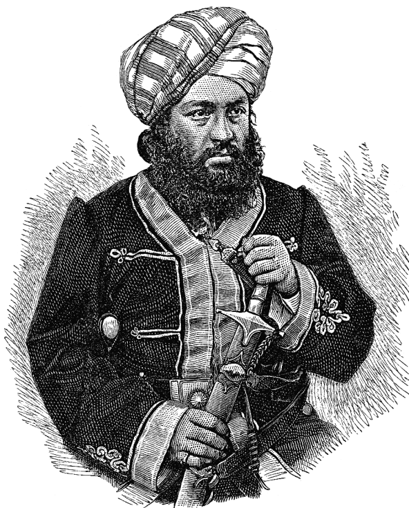
SHERE ALI KHAN, THE AMEER.