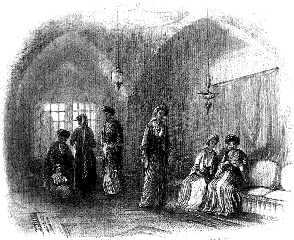
JEWISH FAMILY ON MOUNT ZION.