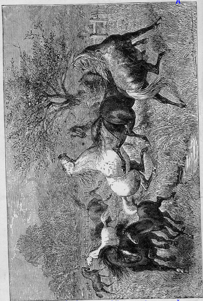
ANIMALS STUNG BY WASPS.