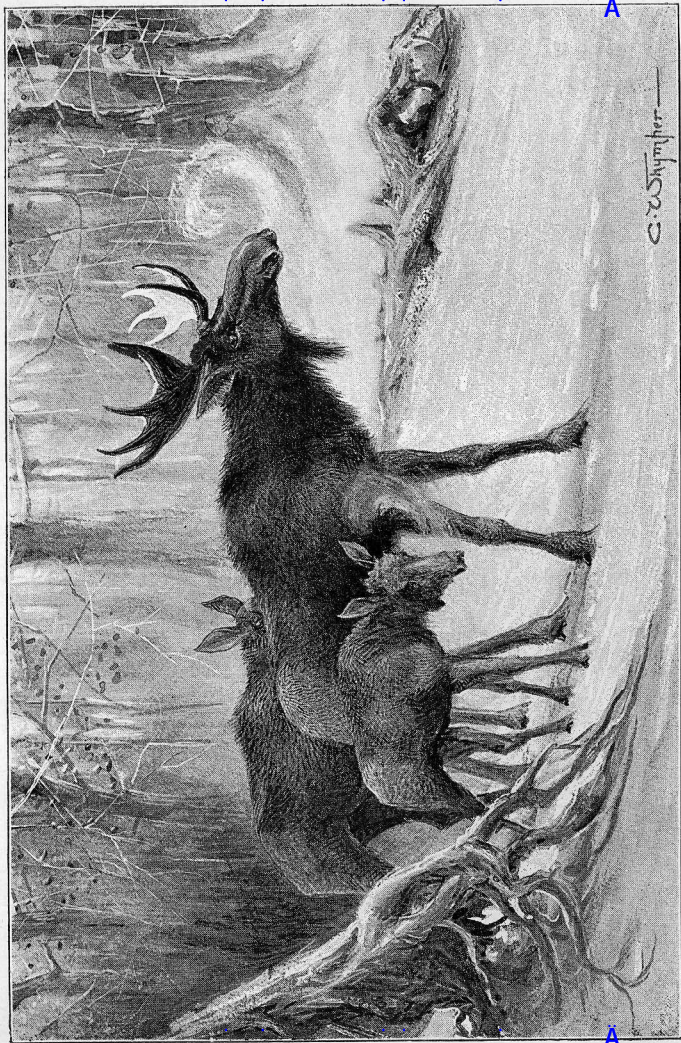
“Crossing the open was a beautiful bull elk, followed by a fine cow and a half-grown calf.”—Page 247.